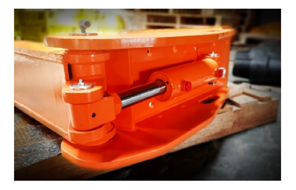
MMK_C_00039 Rev: 0 2022/03/09